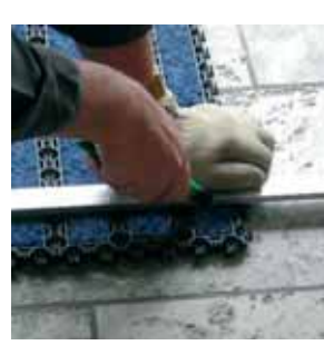
Easy to cut with ruler and knife