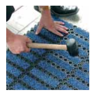
Quick to assemble with a hammer