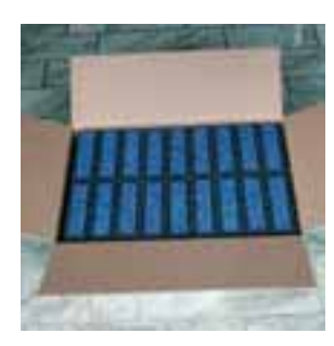
Forma<sup>™</sup> pre-assembled in 6 tile units